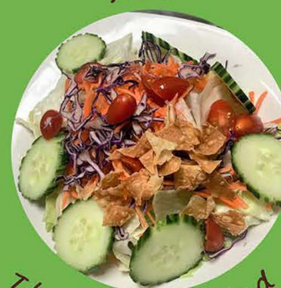
Thai House salad