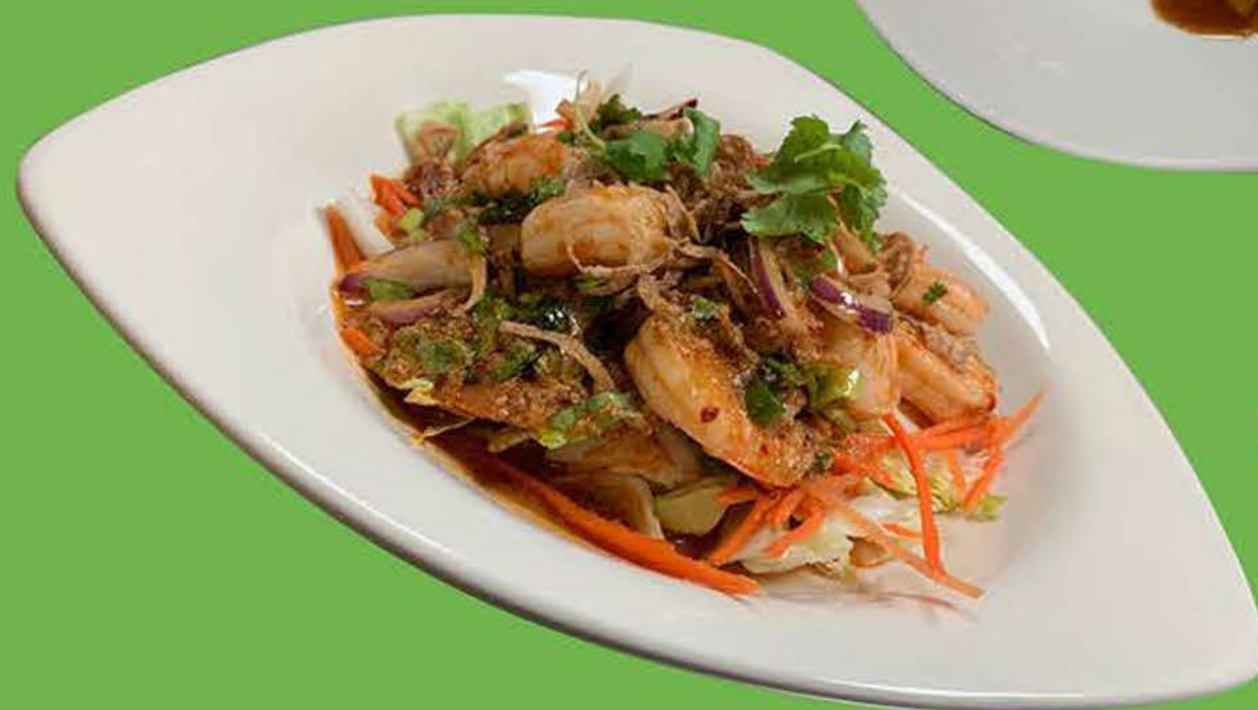
Plah Kung (shrimp)