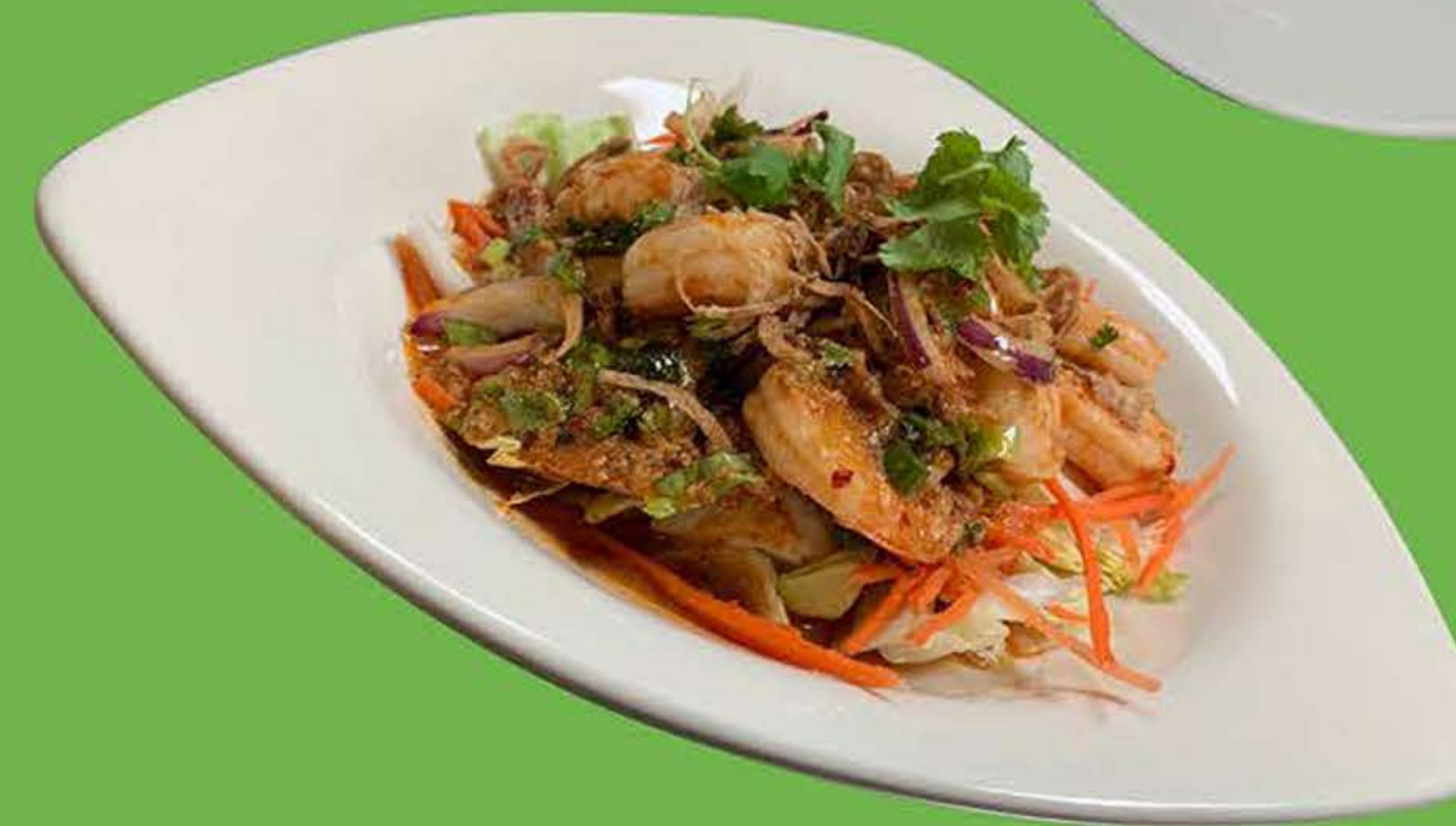
plah Kung (shrimp)