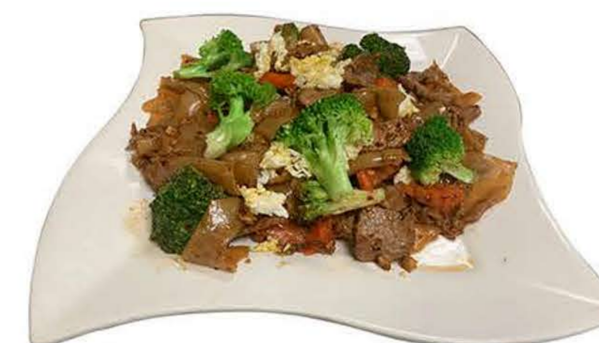
pad see ew

Rad-Nah .....$15.99 (Flat-noodles with Broccoli, Carrots, Snow Peas, Baby Corns, with Black Bean Gravy)