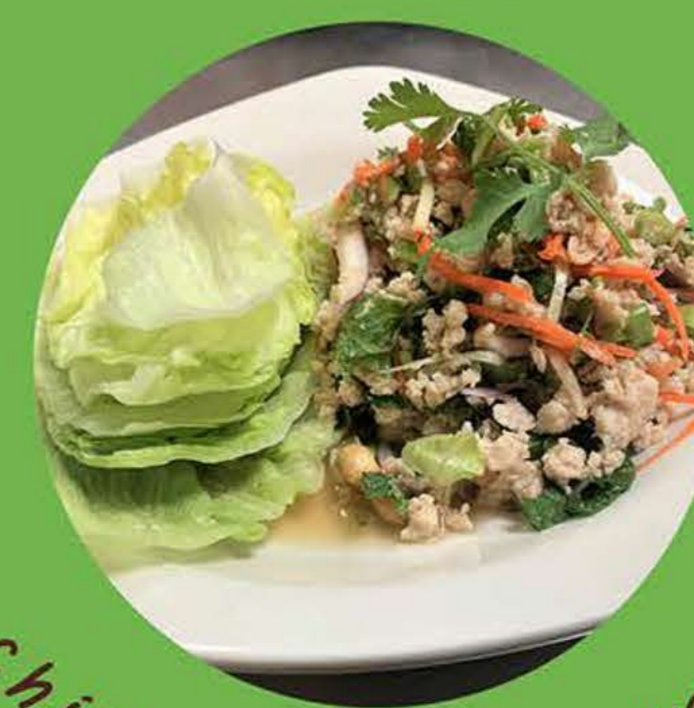
chicken Lettuce wrap